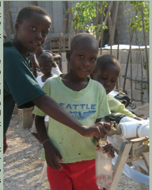
First water from tap stand at the Mission of Hope school campus