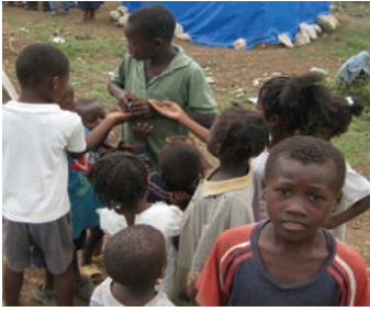
Watching God stretch the energy bar that I gave kids at Morne Rouge