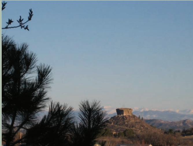
View from the apartment God blessed me with for three months in Castle Rock, Colorado