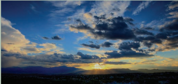
Sunset in Colorado Springs

Over the past month, I have seen God provide in amazing ways: