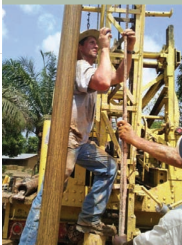
Drilling for Water at Mokanji Hospital

We began a well in the village of Mokanji, on the premises of the hospital Global Outreach Mission is restoring. Mokanji is a very dry place, where it is difficult to find water. Topographically it is positioned higher than the surrounding area. Presently, there are no wells, and people have to go down to the streams to fetch water for cooking. Drinking water comes from a spring located in the valley. One has to walk down a rough footpath to get there.