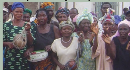
Welcoming the EMI Team to Mokanji Hospital