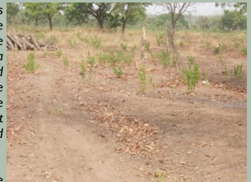
Undeveloped Orphanage Project Site in Ghana