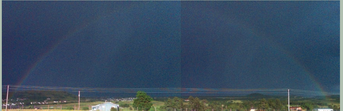
Full Rainbow as I left the apartment in Castle Rock for Colorado Springs

After cleaning the Castle Rock apartment that had been my home for three months, God blessed me by displaying a huge rainbow as I drove out of town toward my new home in Colorado Springs. This was such an inspirational moment that I had to pull to the side of I-25 to take the pictures above and to rejoice again for what God is doing in and through my life. I praise Him for leading me and for providing what I need! The Sovereign Lord will continue to guide and sustain for His glory and praise.