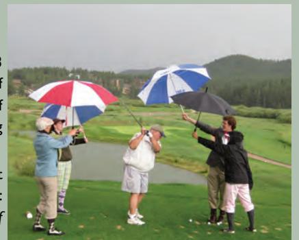
Golfing in the Rain to Make 100 Holes

Just like our project trips as it isn't all about the design, it isn't about playing golf and making money; but does the world recognize the difference in our lives enough to call us Christians and have a desire to want to know who He is and why we are who we are.