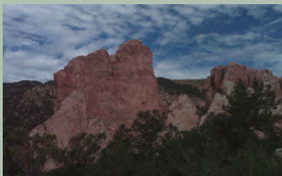
View from My Quiet Spot at Glen Eyrie

Shortly after starting at EMI, the Colorado Springs office took its mid-year day of prayer and fasting at the Glen Eyrie campus. We spent the day worshipping and seeking God for personal spiritual growth, in our roles at EMI, and for EMI as a whole. During corporate worship, God reminded me that “man does not live by bread alone, but by every word that comes from the mouth of the Lord” (Matt. 4 & Deut. 8). Praise the Father that He sent the Word, Jesus, to dwell among us and His Spirit to dwell within us! As I reflected on the Lord surrounding His people like the mountains surround Jerusalem (Ps. 125:2), God reassured me that He not only surrounds me, but