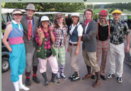
Intern Golf Costumes